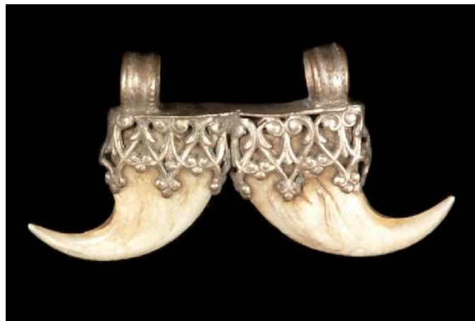
Leopard claw amulet (Ethiopia)

Edgar Rice Burroughs was quick to understand that the art of story telling in the 20th century was not limited to literature. He very quickly sold the rights to his novels to the Hollywood studios, and actively participated in the film adaptations. Since then, the Tarzan character has directly inspired fifty-odd films (including the famous performances by Johnny Weissmuller as a statuesque Tarzan, and by Christopher Lambert, cast as a romantic hero) as well as comic strips (particularly those by Burne Hogarth , whose talent, inspiration and fascination with the body in movement made him the master of the comic strip renewal and the forefather of many later artists), video games, CDs, games, as well as numerous imitations of the character (Tarou, Akim, Zembra and even Rahan). Nowadays, Tarzan remains an instantly recognisable figure through the characteristics that contribute to his iconic status: the vines, the leopard skin loincloth and his unique cry.