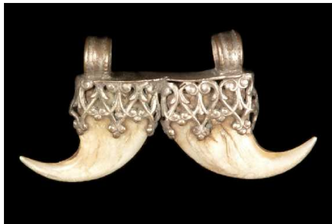
Leopard claw amulet (Ethiopia)

Edgar Rice Burroughs was quick to understand that the art of story telling in the 20th century was not limited to literature. He very quickly sold the rights to his novels to the Hollywood studios, and actively participated in the film adaptations. Since then, the Tarzan character has directly inspired fifty-odd films (including the famous performances by Johnny Weissmuller as a statuesque Tarzan, and by Christopher Lambert, cast as a romantic hero) as well as comic strips (particularly those by Burne Hogarth , whose talent, inspiration and fascination with the body in movement made him the master of the comic strip renewal and the forefather of many later artists), video games, CDs, games, as well as numerous imitations of the character (Tarou, Akim, Zembra and even Rahan). Nowadays, Tarzan remains an instantly recognisable figure through the characteristics that contribute to his iconic status: the vines, the leopard skin loincloth and his unique cry.